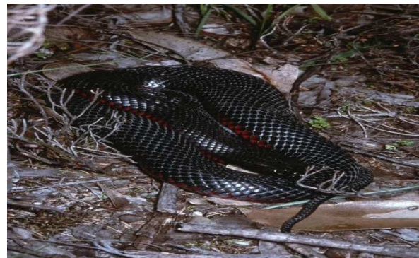
Figure 3. Red-bellied Black Snake

Snakes are protected under the Wildlife Act 1975 . Do not attempt to kill a snake; it is illegal and you are more likely to get hurt.