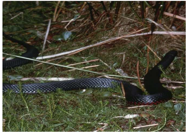
Figure 1. Red-bellied Black Snake

This snake is in the elapid family meaning it is venomous and like all venomous snakes it is front fanged.