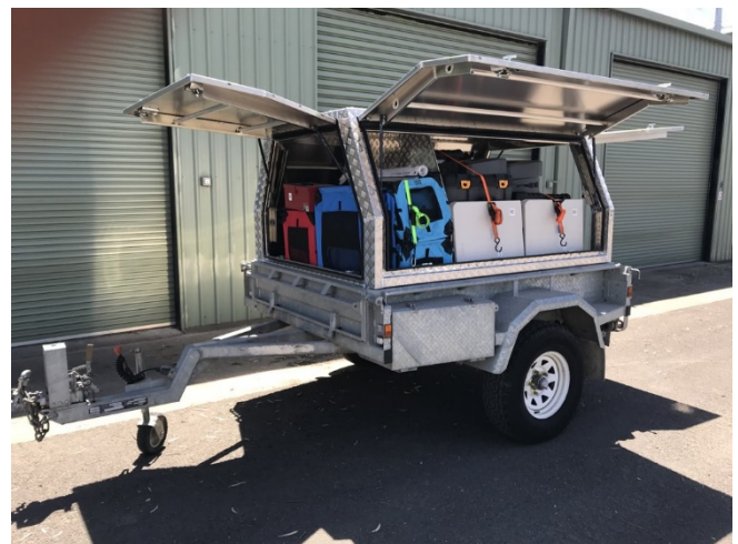
Figure 1: DELWP wildlife triage kit

ZV undertook a preseason audit and maintenance of the contents of the wildlife triage and veterinary drug kits prior to the fire season, making updates as required.