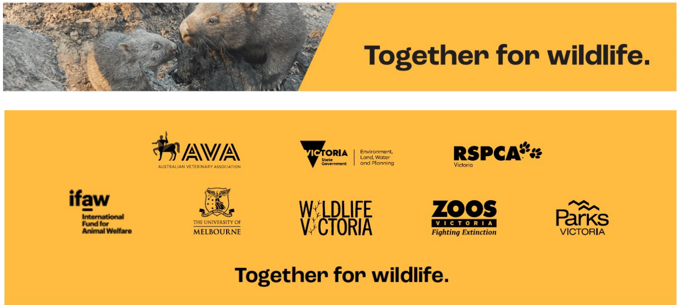
Figure 2 : Together for wildlife banners

The communications working group has also started delivering a series of live webinars under the banner of 'Together for Wildlife', aimed at supporting and educating wildlife volunteers and the animal welfare sector on a suite of wildlife activities to support best-practice outcomes for wildlife welfare in Victoria.