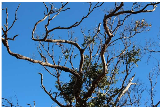
Over-browsing by koalas defoliates their Cape Otway habitat.

Unsustainable koala densities and subsequent over-browsing of the habitat has resulted in the koalas' preferred food trees dying. Without a sufficient food source to sustain them, the health of the koala population can quickly decline, resulting in koala welfare impacts.