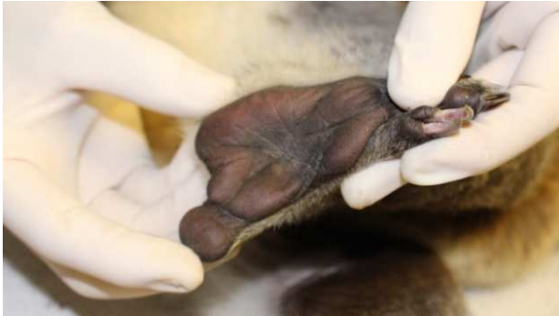
Vets assess the body condition and health of individual koalas.

Four back young were rehomed to a Victorian wildlife park after their mothers were euthanized due to poor health.