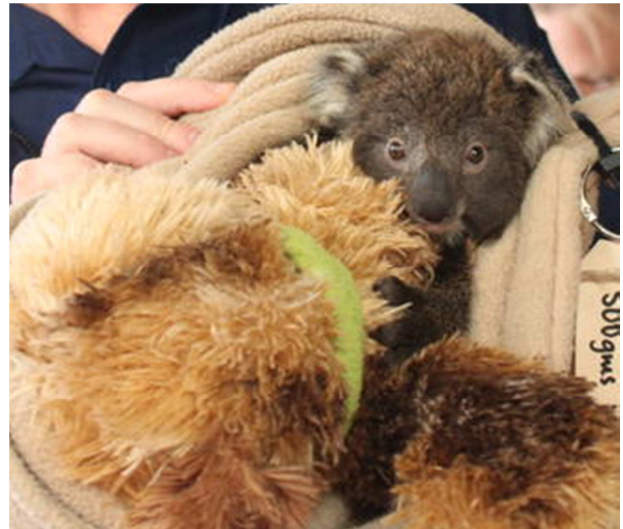
Back young koala being cared for while its mother is being assessed.

A total of 249 healthy koalas were released back to their site of capture at Cape Otway. No dependent back-young were encountered.