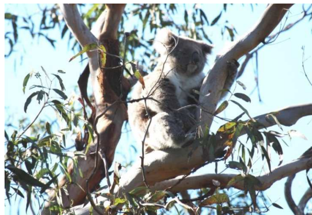
Koalas are reluctant to move from a favourite food source - Manna Gums.

Results from the health and habitat assessment confirmed that further actions were needed to manage the welfare of the koalas at Cape Otway.