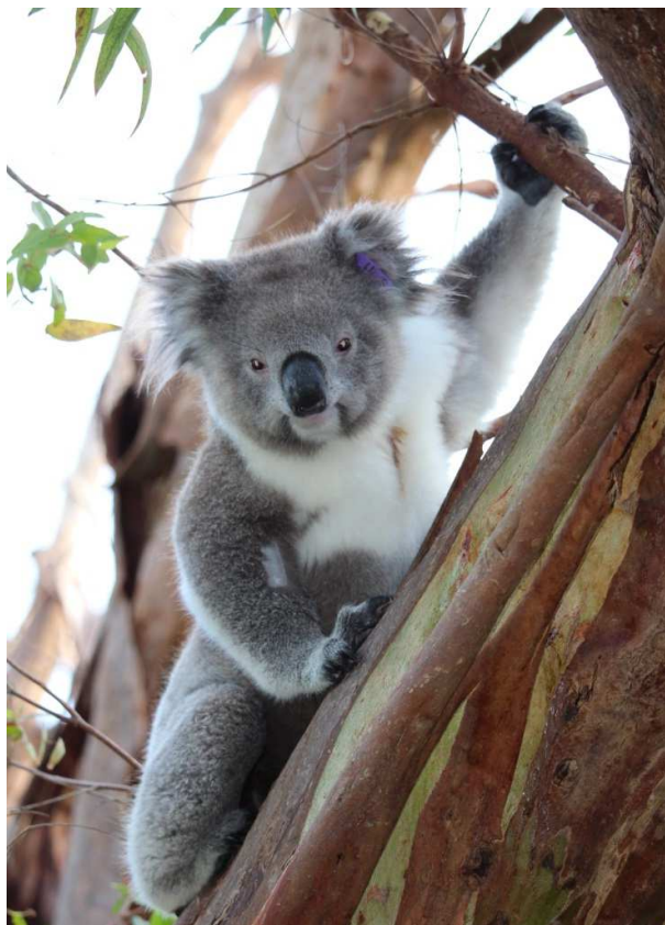
An ear-tagged male koala after release.