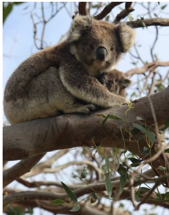
Koalas translocated in late 2015 have settled into their new home.

DELWP would like to extend our sincere thanks to the Cape Otway community especially local landowners, businesses, the Conservation Ecology Centre and other research partners, for their cooperation during the recent fertility control and health check programs at Cape Otway.