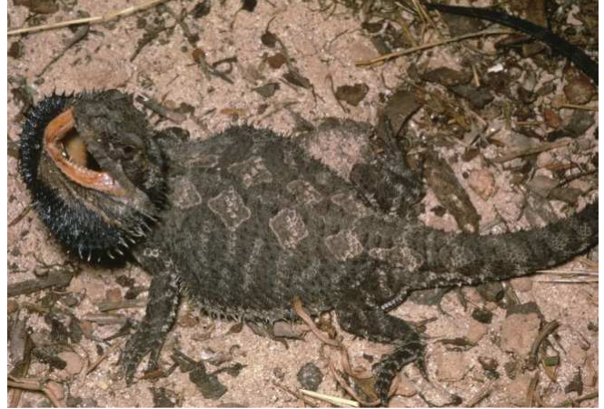
Figure 3. Bearded Dragon

Females lay about 20 eggs. To do this, she will bury herself in a hole and resurface once the eggs are laid. The eggs incubate for 45 - 70 days before they hatch.