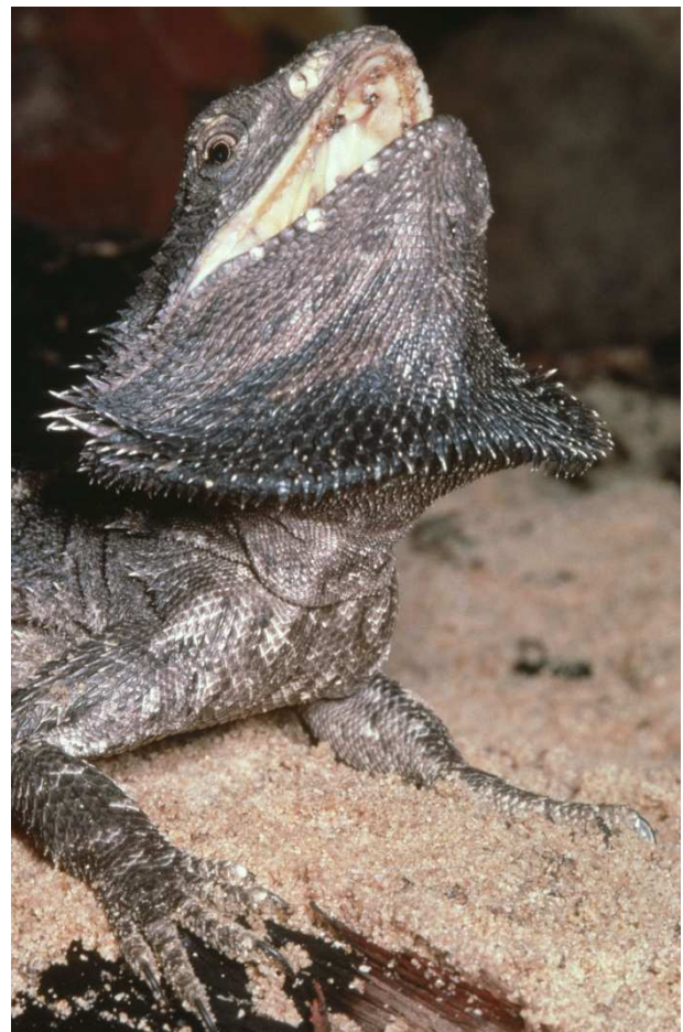
Figure 1. Bearded Dragon

Their colour can vary from grey to brown although they can occasionally be yellowish brown. They're pale underneath, and when puffed up will show a yellow mouth lining.