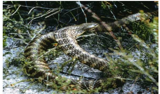
Figure 3. Tiger Snake

Snakes are protected under the Wildlife Act 1975 . Do not attempt to kill a snake; it is illegal and you are more likely to get hurt.