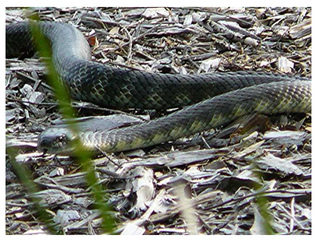
Figure 1. Tiger Snake

Tiger Snakes are often marked by a series of dark brown and yellow-brown bands, but they may or may not be present. Their underbelly is generally lighter than the main body and un-banded.