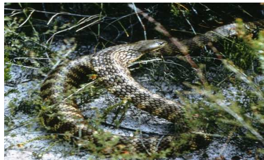
Figure 3. Tiger Snake

Snakes are protected under the Wildlife Act 1975 . Do not attempt to kill a snake; it is illegal and you are more likely to get hurt.