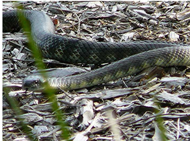
Figure 1. Tiger Snake

Tiger Snakes are often marked by a series of dark brown and yellow-brown bands, but they may or may not be present. Their underbelly is generally lighter than the main body and un-banded.