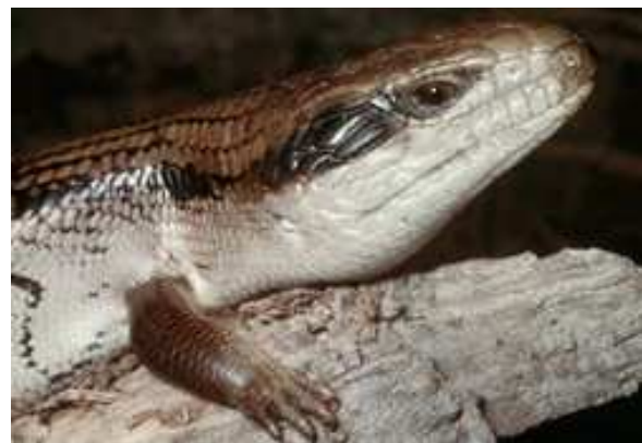
Figure 3. Blue-tongue Lizard

Never try to feed Blue-tongues as they have specific diets.