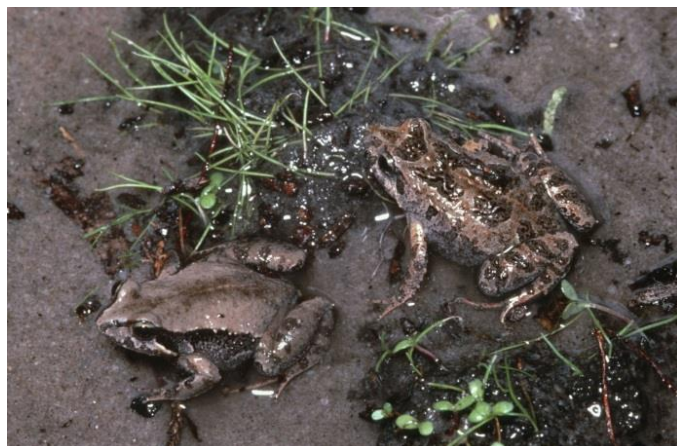
Figure 2. Common Froglet

Providing rocks, logs, leaf litter and appropriate shrubs around your home will keep the frogs happy. In return, you'll be delighted with the sound of their calls.