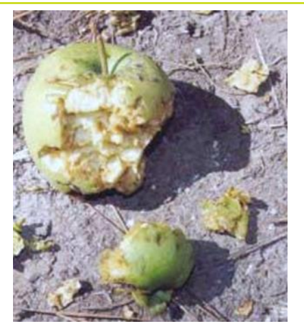
Typical fresh spat made by Flying-fox feeding on apple. Note the fragments of skin and fruit pulp compressed together.