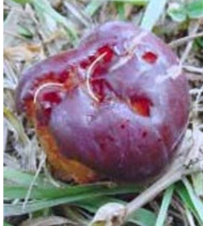
Spats (some circled) and plum stones (some arrowed).

Flying-fox bites on plum. Two separate bites are indicated by the white lines.