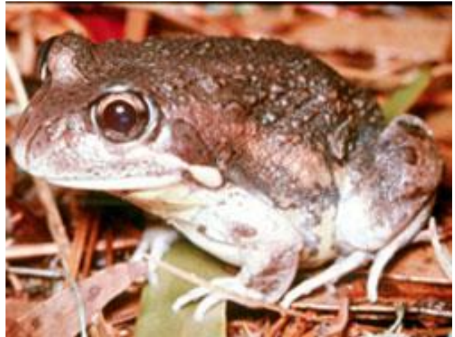
Figure 1. Pobblebonk

The Pobblebonk follows the typical diet of most frogs, feeding on insects, worms and spiders.