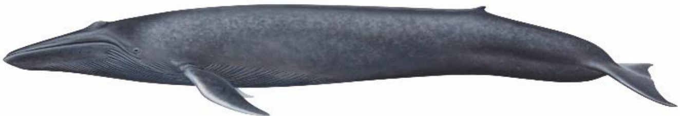
Figure 3. Blue Whale

Menkhorst, P.W. (ed.), (1995), Mammals of Victoria, Oxford University Press, Melbourne.