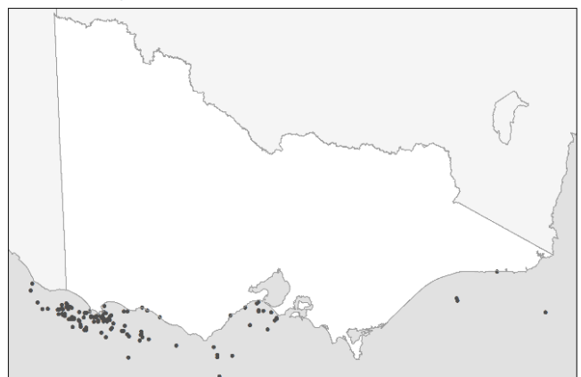
Figure 2. Recorded occurrences in Victoria