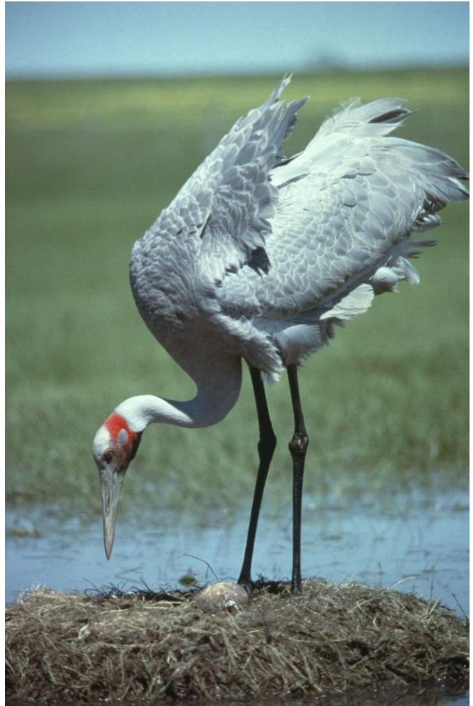
Figure 1. Brolga

Brolgas are quite skilled at foraging for food, and can even do so with their head completely submerged in water. They will use their heavy beak like a crow bar to wedge the ground open and turn it over in search of food. In Northern Australia, Brolgas commonly feed on tubers, which they dig up from the ground using their pointed beaks.