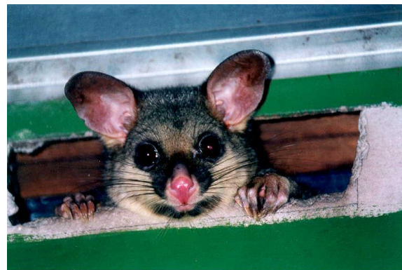
Figure 3. Brushtail possum

Buy or make a nest box and install it in your garden as an alternative den site. Possums are territorial, if one adopts the nest box it is likely to keep others away from your roof and garden.