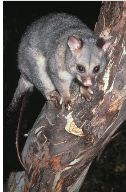
Figure 1. Common Brushtail Possum

Brushtail Possums have black oval shaped ears with white tips. Their tail is black and bushy, but sparsely furred or even naked underneath and at the tip.