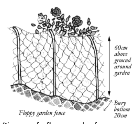
Figure 3. Diagram of a floppy garden fence.

When a possum attempts to climb the fence, it will bend over and then spring back.