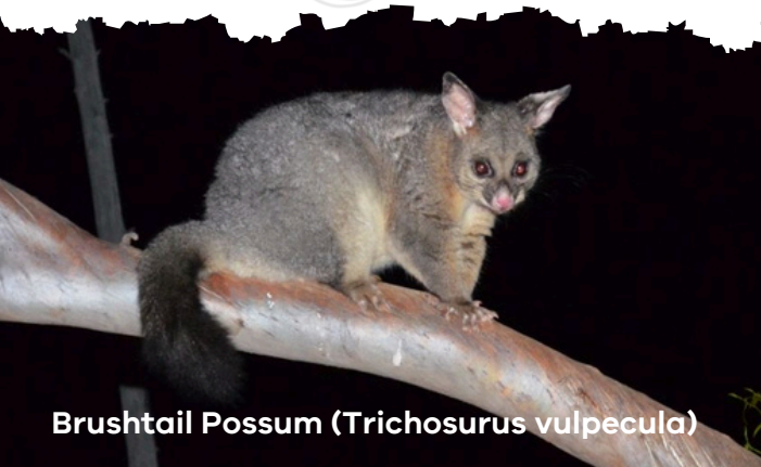
Brushtail Possum (Trichosurus vulpecula)

For more information visit www.wildlife.vic.gov.au/managing-wildlife/possums